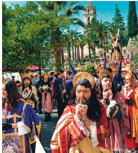
Cabra, Córdoba, Spain

Around these places, religious corporations were born (brotherhoods and sisterhoods), which were responsible for organising devotional manifestations that have evolved over time, and that take on a larger dimension during Lent and the Holy Week. For this very reason, it is possible to observe a geographical area where a number of cultural manifestations coexist in Europe: a diversity of ways for communities to experience the traditions of the Holy Week and Easter.