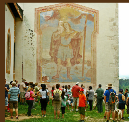
Utrinek iz vodenja po tematski poti Pot v Crngrob A snapshot of a guided tour of the Path to Crngrob theme trail