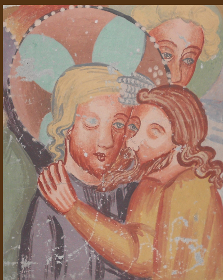
Judežev poljub, kopija freske iz sredine 14. stoletja The Kiss of Judas, copy of a fresco from the mid-14th century

Cerkev Marijinega oznanjenja v Crngrobu je eden največjih spomenikov freskanstva na Slovenskem. Njeno razgibano in dolgo stavbno zgodovino so vseskozi spremljale različne poslikave, ki so nastajale vse od konca 13. pa do druge polovice 19. stoletja. Nekatere od njih so še danes dobro ohranjene, druge pa so in situ že težko prepoznavne ali pa celo obstajajo le še kot kopije v muzejih. Na razstavi, ki jo pripravljamo v okviru projekta Crngrob naokrog, bomo predstavili freske, ki so na svoji izvorni lokaciji že nerazpoznavne, zakrite, težko dostopne, zbledele ali neobstoječe.